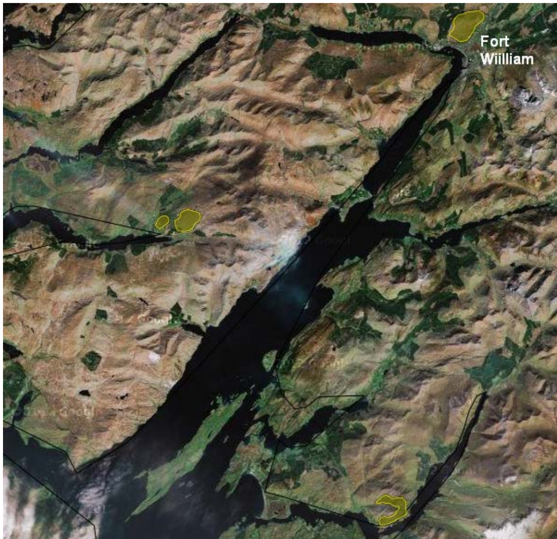
Figure 2: Burn scars in Fort William area recorded by NASA's MODIS sensor on the Terra and Aqua satellites after the 2 April 2013 wildfires. Yellow shading shows the burned areas on a true colour Google Earth image. The sky was clear enough between 2 and 9 April for the sensor to record light reflected from the charred ground.

The charred ground of the fire scar reflects light differently from live vegetation. This is recorded by the sensor's optical bands. The burned area is updated as further cloud-free images are acquired, up to the point where the vegetation regenerates and the fire scar can no longer be detected, or cloud cover gets in the way ( more information ).