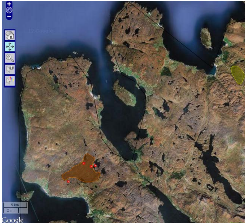
Figure 3: Two wildfires in Wester Ross, Caithness and Sutherland, NW Scotland, detected by NASA's MODIS sensor on the Terra and Aqua satellites. Hotspots (yellow squares, with red boundaries added for emphasis) indicate the approximate position of the active fire front at the times of the overpasses on 2 April 2013. Shading of the burned area indicates the age relative to date of query (11 April 2013). The 680 hectare (6.8 km 2 ) orange shaded burn scar was imaged between 2 and 9 April, and the older 190 (1.9 km 2 ) hectare yellow one, between 1 and 2 April.

A fire in Wester Ross, Caithness and Sutherland was detected both as active fire hotspots on 2 nd April, and as a burned area between 2 nd and 9 th April (Figure 3). The shading of the burn scar indicates its age relative to the date the EFFIS database was queried (11 th April 2013). Orange shading shows that it was detected in one to seven days before 11 th April 2013. Yellow shading indicates a burn scar detected seven to 30 days ago.